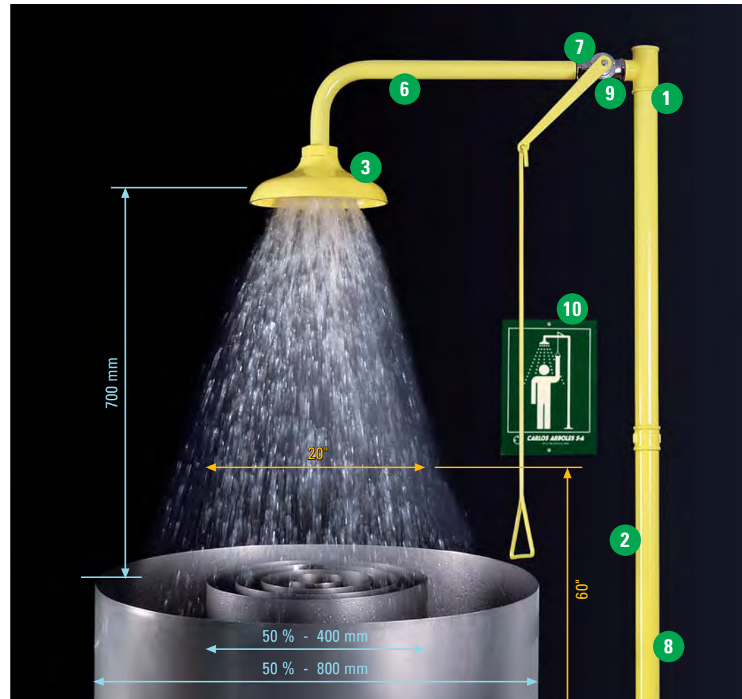
ANSI STANDARD EN STANDARD

Anti-corrosive polyamide 11 plastic coating, in HIGH-VISIBILITY YELLOW color. This plastic coating has a thickness of 250 to 300 microns. It has good resistance to acids, bases, sea water, oils... The coating is not derived from petroleum, but is a raw material originating from vegetable oil, and therefore, it preserves the environment. We have a Chemical Resistance Table, which can be consulted on our website: www.carlosarboles.com .